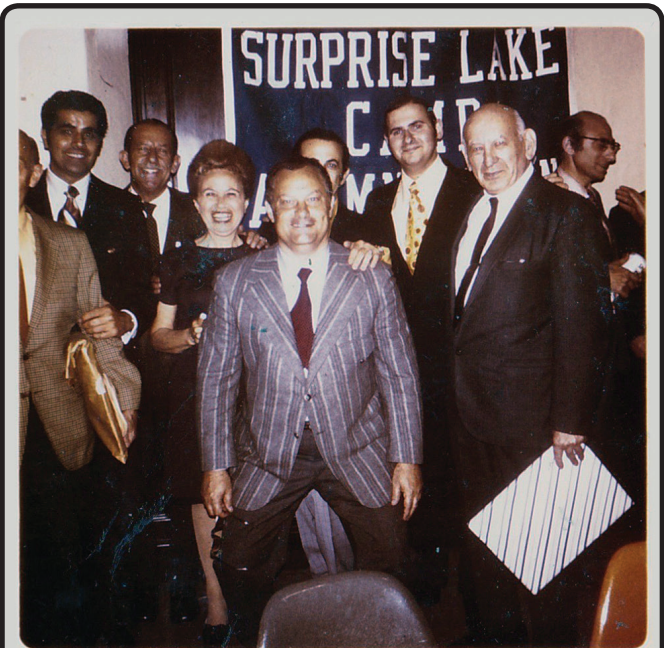
SURPRISE LAKE CAMP ALUMNI ASSOCIATION Board of Directors Photo – 1972 – (Left to Right)

Good News for those older alumni who want to use their IRA assets for charity. In December of 2015 the Qualified Charitable IRA Distribution provision was made permanent. What does this mean? For a donor who is over the age of 70 ½ and has the means to part with some or all of his or her IRA assets up to $100,000, the IRA distribution can be a tax efficient way to benefit an eligible charity such as SLC. This distribution to an eligible charity incurs no income tax as long as it is distributed directly from the IRA to the charitable organization. Of course, because there is no income tax incurred on the transfer, there is also no charitable deduction allowed for it. This benefit may also be used to satisfy the required minimum distribution from an IRA for individuals over ages 70 ½, again as long as it is distributed directly to the eligible charitable organization. Just reminding you that SLC is such an eligible charitable organization and we are always grateful for the philanthropic support of our alumni and friends.