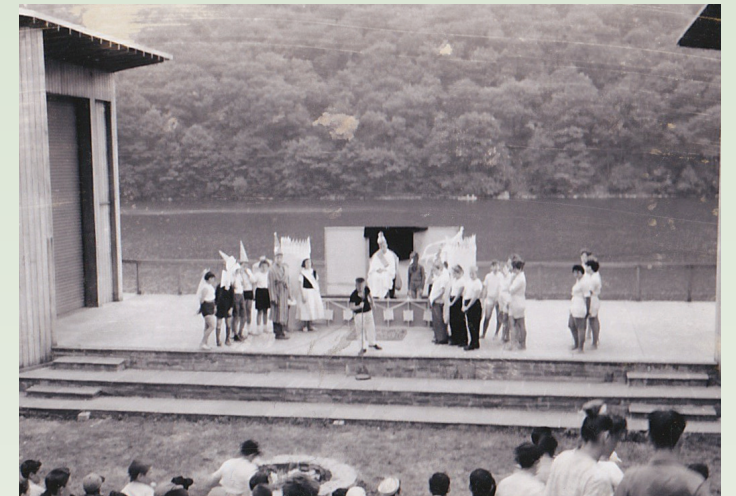
Campers performing at the Eddie Cantor Theater.

Another memorable event that I recall was a Friday night Sabbath Service in our unit, which happened to be Unit C.